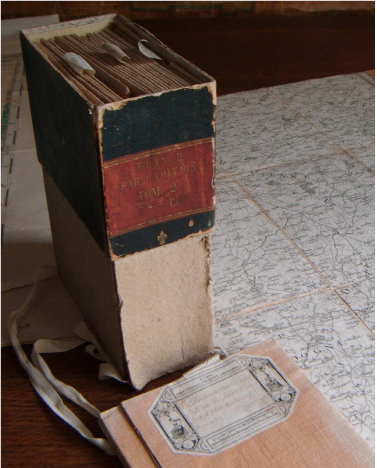
34. Louis Capitaine & Pierre de Belleyne, Carte de France comprenant la détermination de toutes les Municipalités . 1:345,600, c1818. Sheets 7-12 (a west-east swathe across central France corresponding to one-quarter of the whole - for a key, see the large figures on http://www.cartocassini.org/cartecassini/france_NB.htm ).