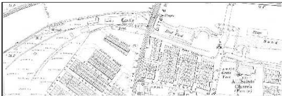
Cheshire 1:2500 sheet XXIV.3, revised 1905

A sequence of frequent revisions of Runcorn