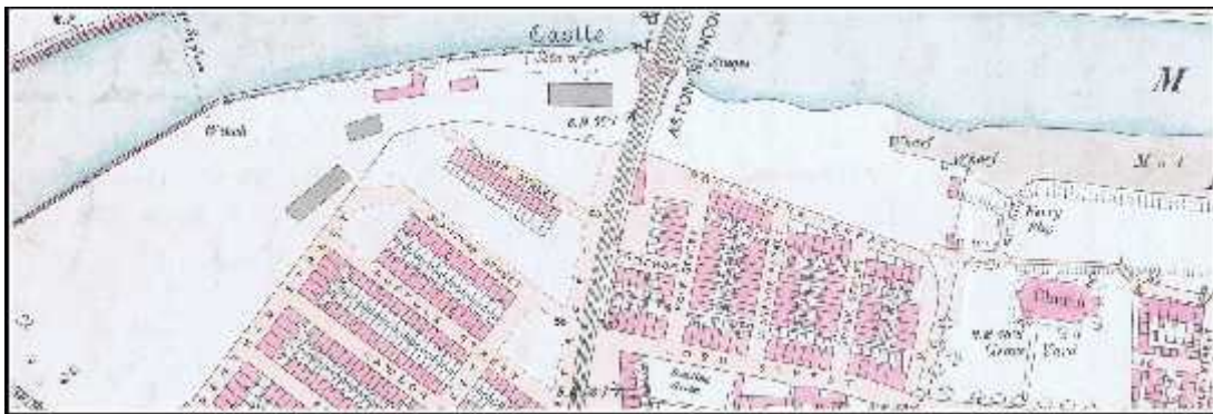
Lancashire 1:2500 sheet CXV.13, revised 1894