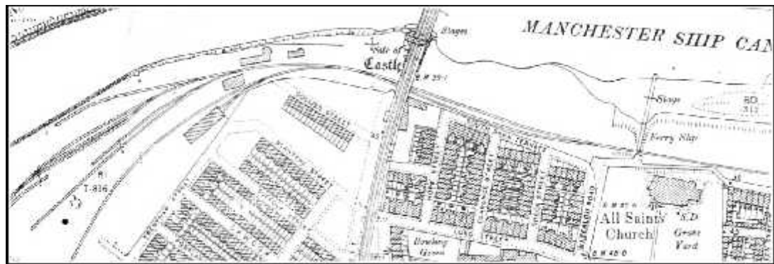
Cheshire 1:2500 sheet XXIV.3, revised 1897