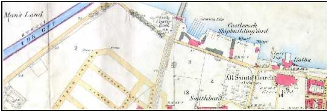
Cheshire 1:2500 sheet XXIV.3, surveyed 1874