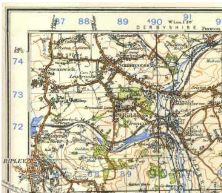
Figure 1. The upper left corner of GSGS 3907 sheet 54, Second War Revision, printed 1942. This is a military derivative of the one-inch Popular Edition: the two-inch alpha-numeric squaring of the civil version has been replaced by figures for the military grid.

Map frames and borders can occupy a remarkably high proportion of space. On the 1:50,000 Landranger the border is 2.5 cm wide, that is 825 sq cm, or 9.3 per cent of the total paper area; on both the Irish 1:50,000s the border is 2.25 cm wide, occupying about 7.6 per cent of the paper on current OSNI issues and about 6.9 per cent on current OSI issues. Another way of putting it is that the border on the Landranger occupies an area equal to about 12.9 per cent of the mapped area. In contrast, the border on the one-inch Popular Edition is about 1.23cm wide, or about 1 cm if the outside framing is discounted: including the redundant framing, this gives a border equal to 9.1 per cent of map area, or 7.4 per cent if the framing is discounted. (See figures 1 and 2.) The comparison is more in the Popular’s favour than might at first appear, as the map area of the Landranger is over twice as great: 6400 sq cm compared with 3135 sq cm. A 1.0 cm border on the Landranger would be equal to about 4.1 per cent of the mapped area. Both borders include the same information: distances to towns outside the map, completion of names, latitude and longitude values, and grid figures. 19