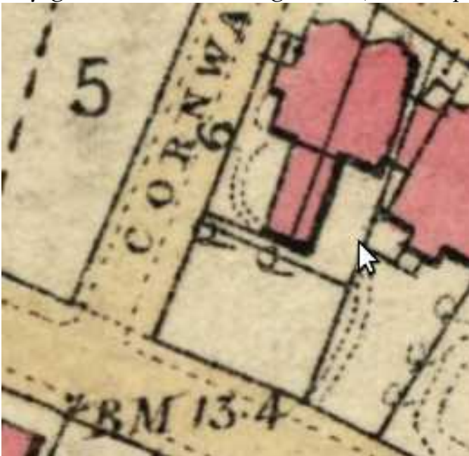
Fig 2: Further south from Fig 1.

The join of (2) and (3) is shown at figure 1. Again, lines do not continue across the parish boundary as smoothly as they might, but any irregularity is made less noticeable by the presence of the boundary symbol. What I want to draw attention to is a difference between the two parishes in deciding which names are worthy of inclusion. To the west of the boundary every other villa along the sea-front is named: the final name, 'Eton', has presumably lost the 'House' because this was drawn in the empty space corresponding to St Helens. To the east of the boundary, nothing is named until Cheltenham House is reached; the motivation was perhaps not so much that Cheltenham House was any grander than its neighbours, as the presence of empty space adjacent to it.