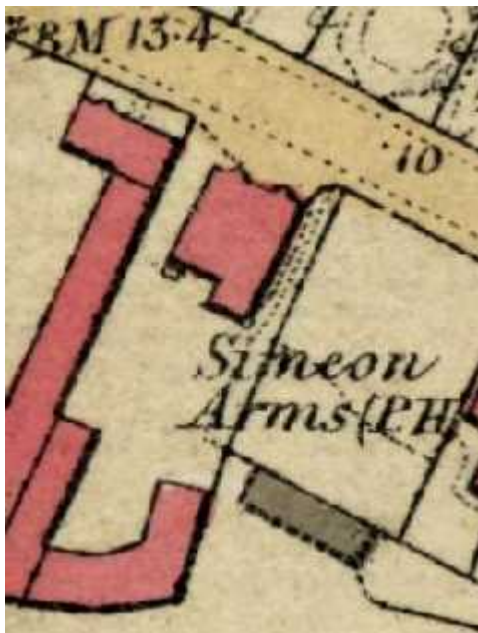
Fig 4: Further south from fig 2

(2) is another case of land-use ornament. The regular 1:2500 (though not the special sheet) carries a pattern of short blue lines; the area book 2 describes it as 'Pasture etc (subject to floods)'. I presume the blue lines indicate 'subject to floods'. In contrast, the six-inch gives it a 'marsh' symbol. While marshes are often subject to floods, and land subject to floods is often marshy, the two categories are by no means synonymous and the two scales convey significantly different information. The difference between the 6-inch and the standard 1:2500 is a puzzle that cannot be resolved here. The difference between the two 1:2500 versions may represent no more than a lapse in the hand-colouring process.