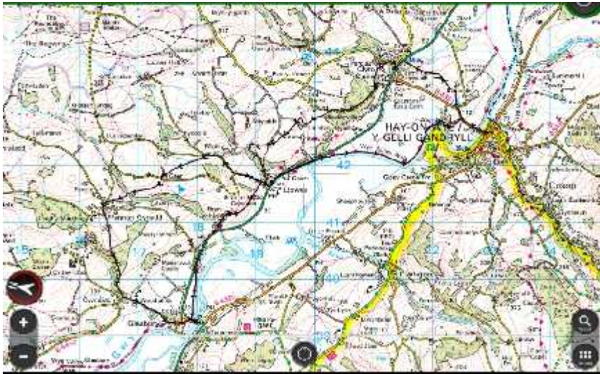
Figure 1 (top): A 14.2 miles walk from Hay-on-Wye, tracked in ViewRanger. The position of the North arrow indicates the orientation of the tablet at the time the screenshot was taken, rather than the orientation of the map

bungee jump off a cliff edge then resumed walking.) I have not installed an optional file to apply a mean sea level correction which may also account for some of the differences seen.