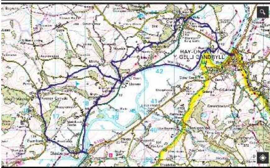
Figure 2 (centre): The same walk, imported as a trail into OS MapFinder