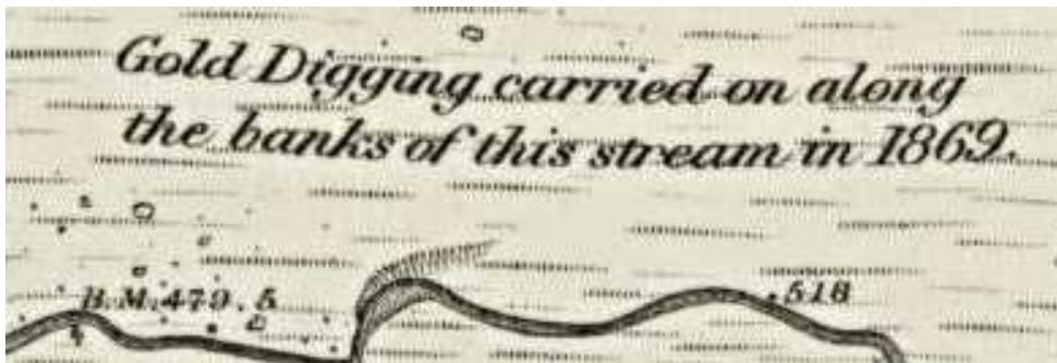
Sutherland sheet 67: one of the 1869 notes

The note found on the modern map can actually be traced back to the first edition of the County Series, to Sutherland sheet 67, published 1877-8 but surveyed as early as 1871. So when the surveyors actually wrote down the description, the events they were describing had come to an end only about 18 months before. One wonders whether the description should be regarded as ‘history’ so much as an explanation for a confused mess of channels and remains of temporary dams along the lines of the burns, a landscape which was deemed too temporary to be worth surveying but was felt to require a note of some sort.