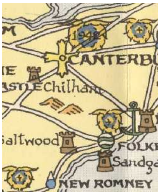
Part of Bartholomew Historical Map - Four Air Battle symbols in East Kent