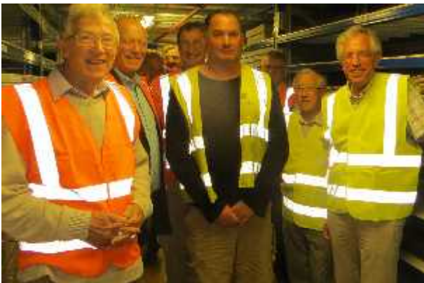
Members on a recent visit to the Bodleian Library Book Storage Facility in Swindon pause briefly whilst browsing in the collection of over a million maps.

As mentioned earlier, Character of writing for Ordnance Survey plans entered the public domain when it formed the final section of the 1888 Description. Though still dated November 1881, it had been revised and reformatted to include a column showing writing used at the one-inch scale. New entries were added such as Canals Dismantled or Abandoned, Railway Junctions that are not stations (their italics) and Shipbuilding Yards. Others, such as Latrines, are deleted. It made further appearances in the 1890 reprint of the Description, and in the only known Ordnance Survey county catalogue, of Nottinghamshire, in 1888. 6 In its internal OS 404 format, two later editions are recorded, revised to November 1891, 7 and June 1914, 8 this last classified For Office Use Only. Both were extended by incorporating some of the sections already to be found in the Description booklet.